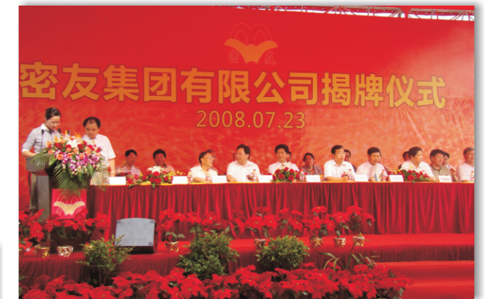
2008年7月23日密友集团有限公司揭牌 July 23rd, 2008, Miyou Group Founded